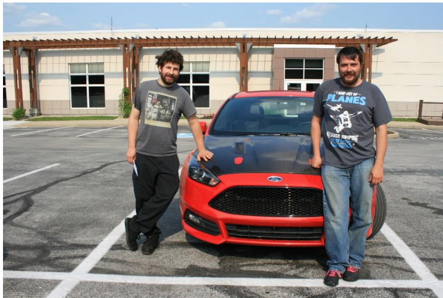
2019 Baseball Rally Participants