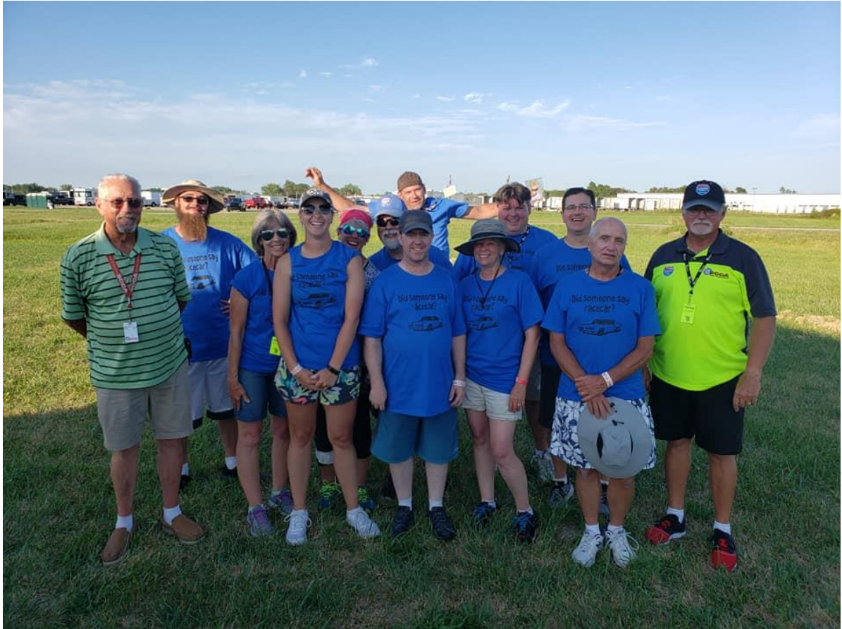
The 2019 Indy crew for the CAM Challenge at Grissom